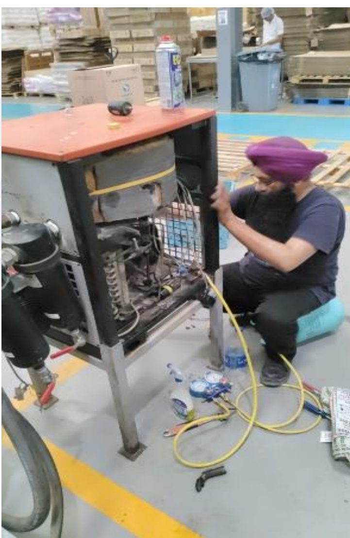
Heating Air Conditioning, Refrigeration Installation and Maintenance, Mechanical / Electrical / Plumbing Sanitary Ware Fixing Construction Building Works, MEP Maintenance