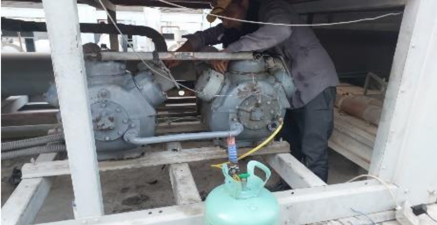
Heating Air Conditioning, Refrigeration Installation and Maintenance, Mechanical / Electrical / Plumbing Sanitary Ware Fixing Construction Building Works, MEP Maintenance