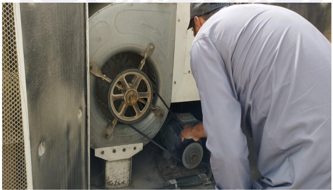
Heating Air Conditioning, Refrigeration Installation and Maintenance, Mechanical / Electrical / Plumbing Sanitary Ware Fixing Construction Building Works, MEP Maintenance