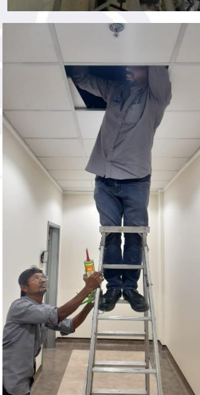
Heating Air Conditioning, Refrigeration Installation and Maintenance, Mechanical / Electrical / Plumbing Sanitary Ware Fixing Construction Building Works, MEP Maintenance