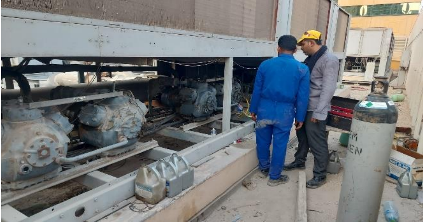
Heating Air Conditioning, Refrigeration Installation and Maintenance, Mechanical / Electrical / Plumbing Sanitary Ware Fixing Construction Building Works, MEP Maintenance