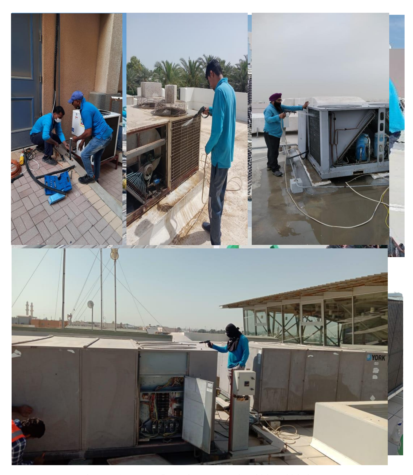
Heating Air Conditioning, Refrigeration Installation and Maintenance, Mechanical / Electrical / Plumbing Sanitary Ware Fixing Construction Building Works, MEP Maintenance