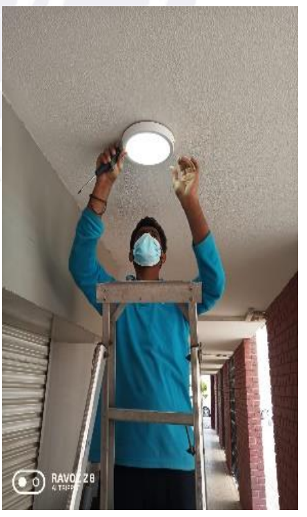
Heating Air Conditioning, Refrigeration Installation and Maintenance, Mechanical / Electrical / Plumbing Sanitary Ware Fixing Construction Building Works, MEP Maintenance