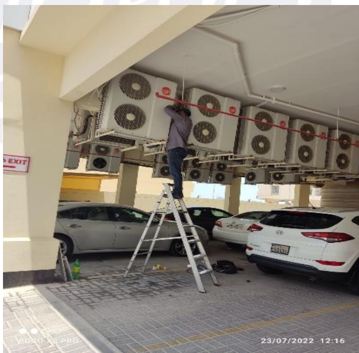
Heating Air Conditioning, Refrigeration Installation and Maintenance, Mechanical / Electrical / Plumbing Sanitary Ware Fixing Construction Building Works, MEP Maintenance